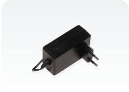
48 V 0.95 A power adapter