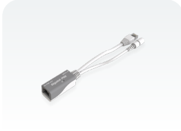
Gigabit PoE injector