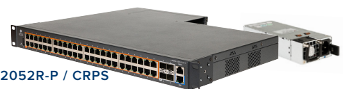
EX2052R-P / CRPS