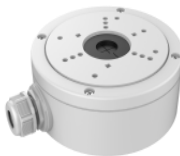
DS-1280ZJ-S Junction Box