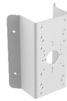
DS-1276ZJ-SUS Corner Mount