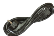
2x IEC cord